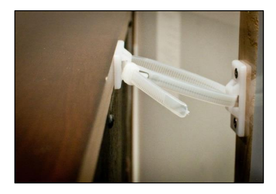
Step 4: Install and tighten strap.

Attach the wall bracket in the stud you marked, at a height just below the top of the furniture being anchored. The image shows a bracket installed on a bare stud to illustrate proper positioning.